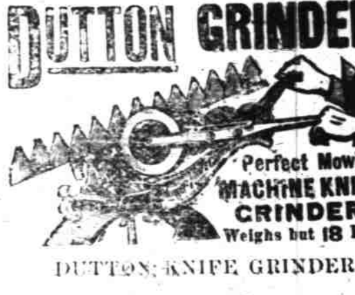
DUTTON KNIFE GRINDER.

WE HAVE A LOT OF RICKFORD AND HUFFMAN GIBBON AND FERTILIZER DRILLS, THE BEST EVER OFFERED ON THIS MARKET. DISC HARROWS, CULTIVATORS AND PLOWS. WE HAVE A FULL LINE OF FARM AND ROAD WAGONS, PHAE TONS, SURREYS, CARTS, ETC. WE HAVE CUT PRICES ON ALL THE GOODS ABOVE NAMED, AND NOW IS THE TIME TO GET BARGAINS. WE WILL NOT BE UNDESOLD.