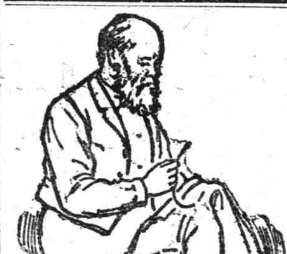
On the mend

Wednesday evening was set apart as the time to hear the compositions of ten young ladies. At half past two o'clock they marched into the hall headed by two marshals while the Steel Creek band played a beautiful march.