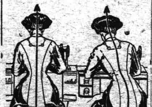
Being prepared for Standard Sewing Machine

Salisbury, N. C. Special Demonstrators The Straight and Curved Lines,