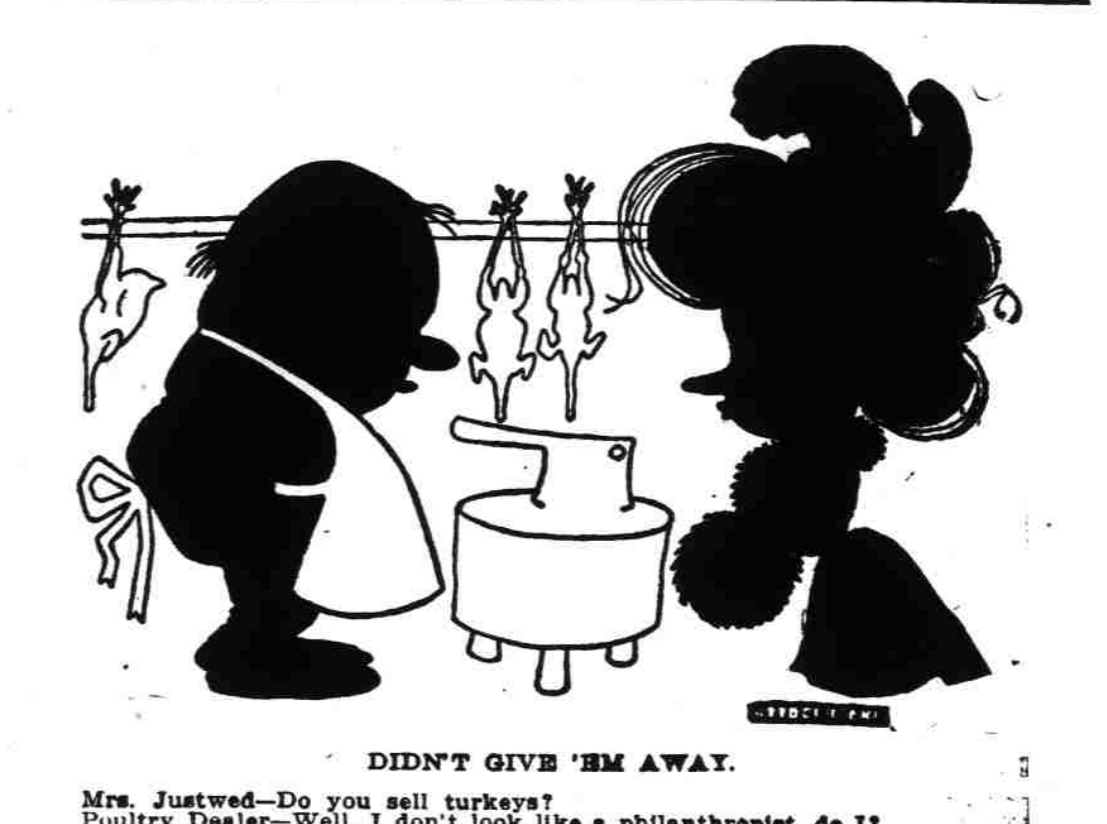
DIDN'T GIVE 'EM AWAY. Mrs. Justwed—Do you sell turkeys? Poultry Dealer—Well, I don't look like a philanthropist, do I?

FARM POWER COMPANY, (Near Grimes' Mill) 212-216 North Church Street. Salisbury, N. C.