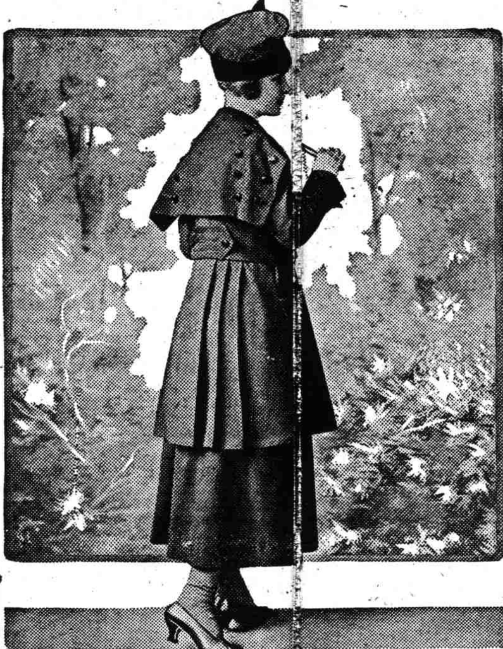
Capes and Buttons Again.

If you like capes and buttons you may have them along with your new fall suit; that is, if you will practice some self-restraint. Buttons appear in small companies not in regiments, as they did on suits for spring and about the widest of capes is that on the suit pictured here.