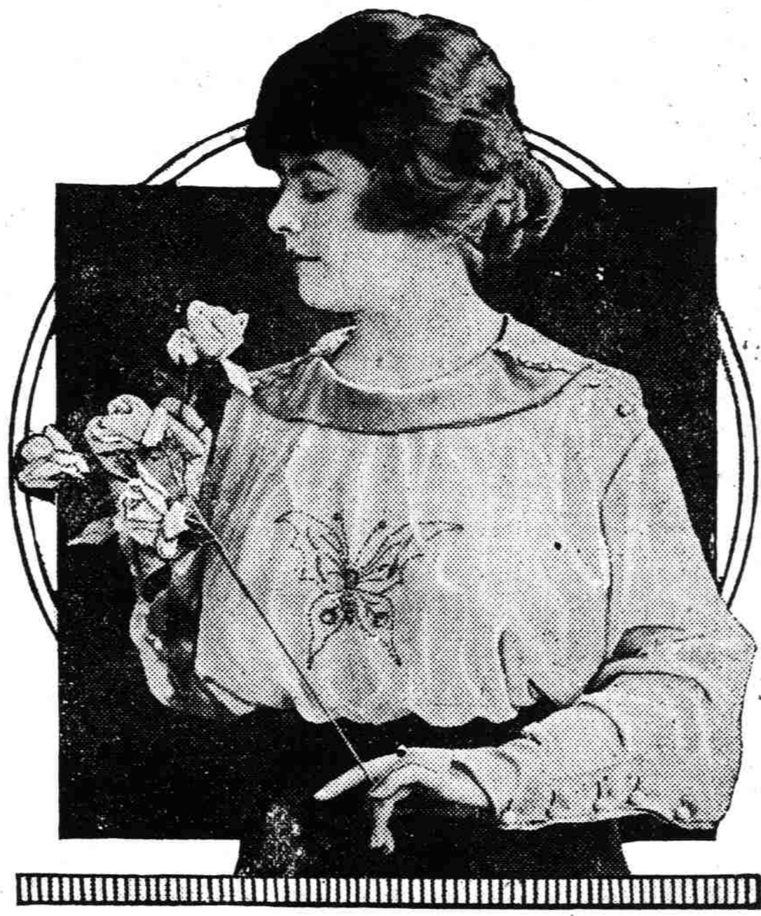
Blouses in Filmy Fabrics.