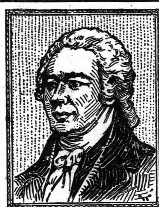
Alexander Hamilton First Secretary of the Treasury