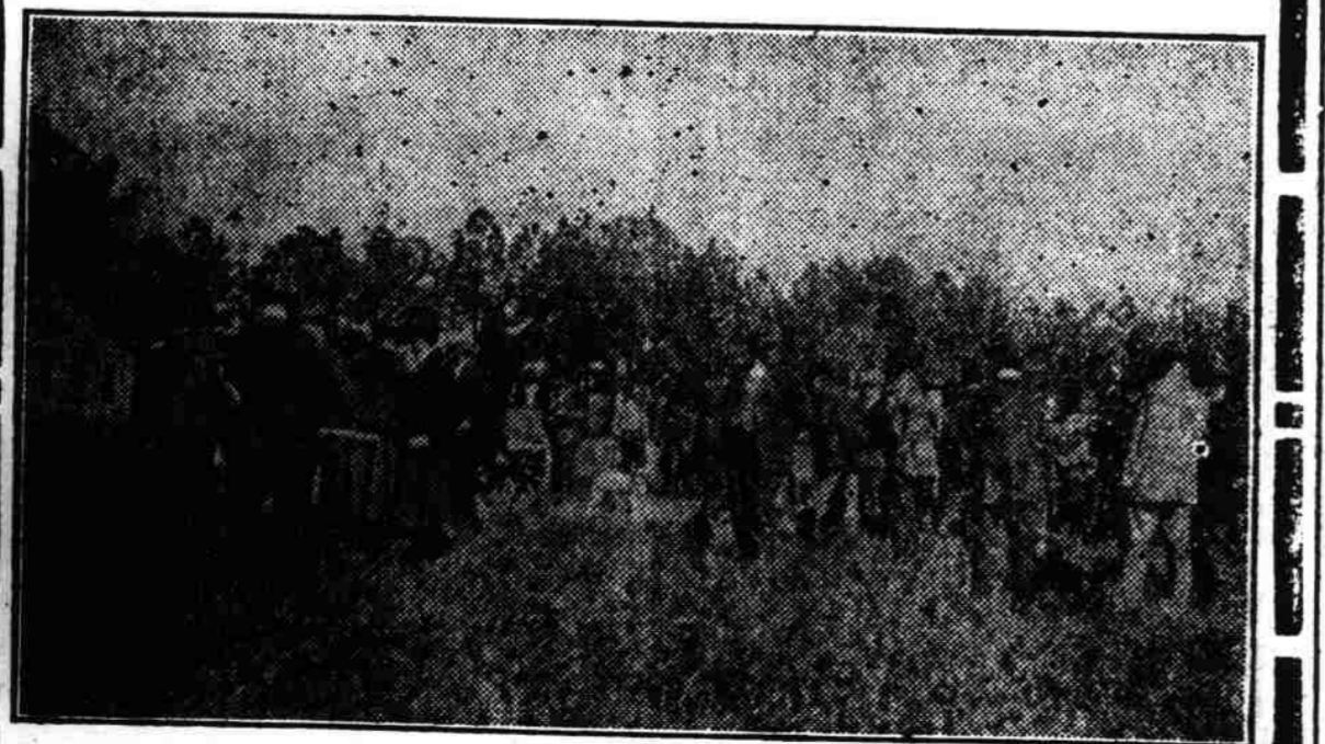
VIEW OF ONE OF OUR FARM SALES

If you have Farms or Lots to sell—write us. We will sell it to your advantage even if it is rented out for this year. The service we render our clients is complete in every detail. We make necessary improvements on property—sub-divide and attend to the publicity details of each sale.