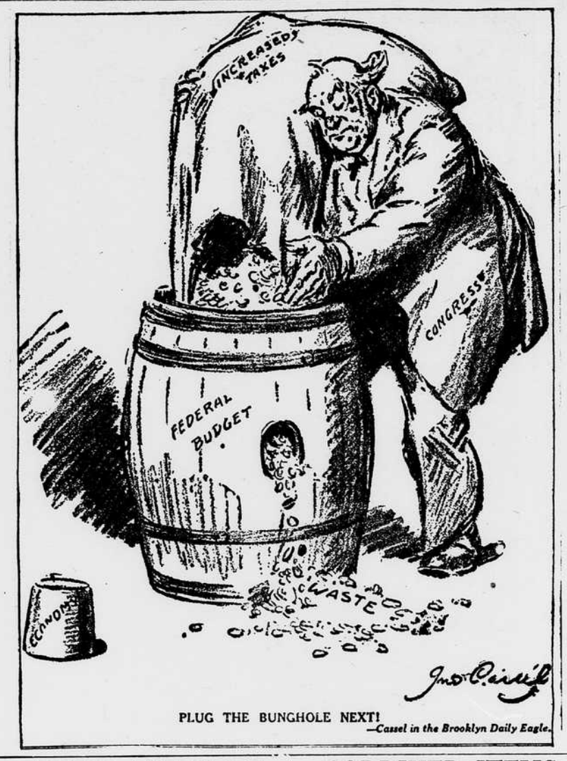
PLUG THE BUNGHOLE NEXT! —Cartoon in the Brooklyn Daily Eagle.

Take Theford's Black-Draught for Constipation, Indigestion, and Biliousness.