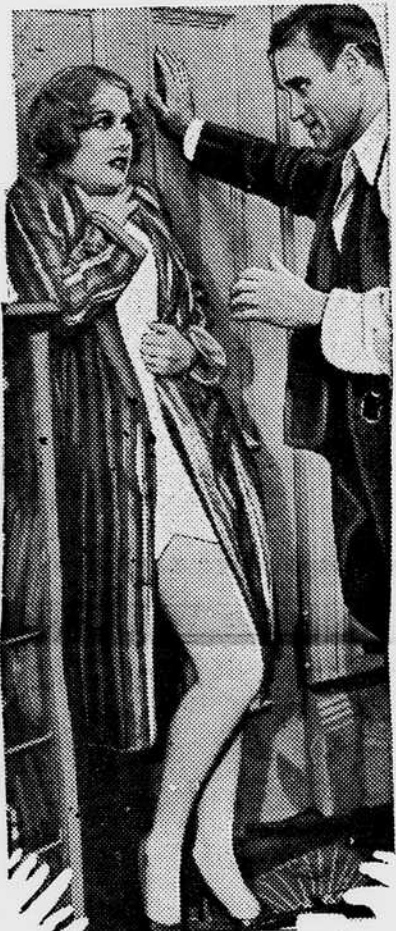
ANITA PAGE and WARNER RICHMOND in "NIGHT COURT" Friday and Saturday