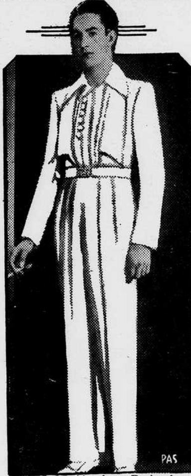
The latest idea from Paris of evening clothes for well-dressed men