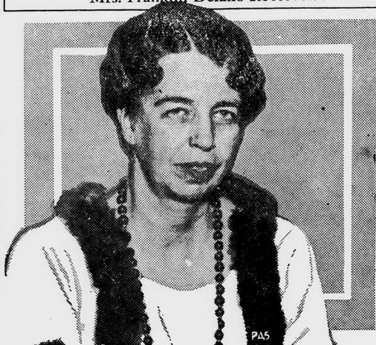
Mrs. Franklin Delano Roosevelt

A most recent informal picture of Mrs. Franklin Delano Roosevelt, wife of the President-elect, who on March 4, 1933 becomes the "First Lady" of the land.