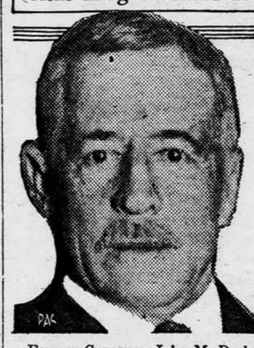
Former Governor John M. Parker, of Louisiana heads a group of his state's citizens which has filed charges with the U. S. Senate asking the removal of Senator Huey (Kingfish) Long on the grounds of personal dishonesty, corruption etc. etc.