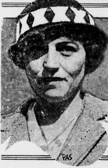
Pearl Buck, who returned home to America to win great fame and the Pulitzer prize for her book "The Good Earth", has again faced East, sailing for China again last week. She plans to meet husband and daughter in England, then on to the Far East.