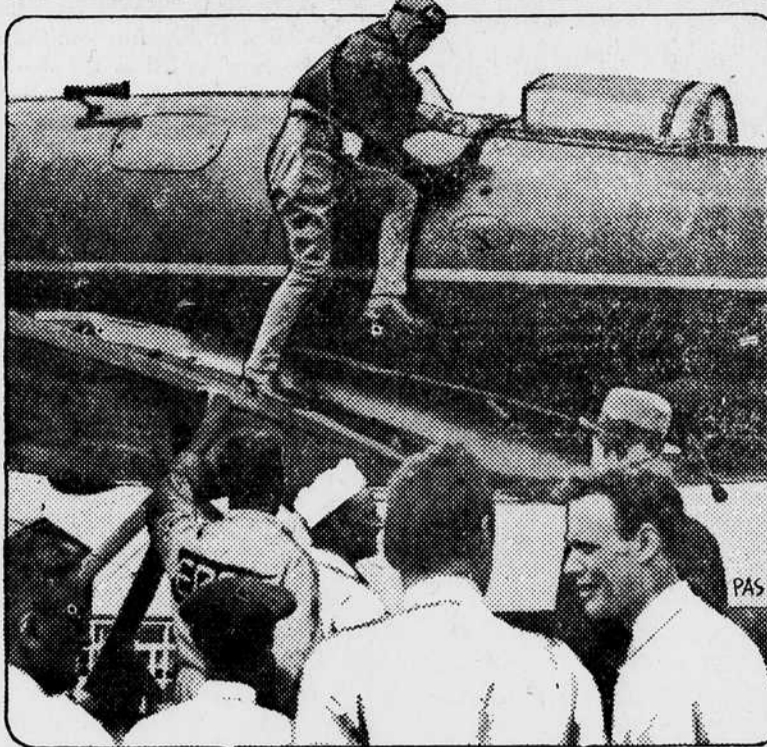
Here are the Lindberghs, Colonel and Mrs. Charles A., as they climbed in their plane for the take off from New York to survey a northern air route to Europe via Labrador, Greenland and Iceland. Mrs. Lindbergh, as radio operator and observer, is shown climbing into the plane. Col. Lindbergh is at the right in the foreground.