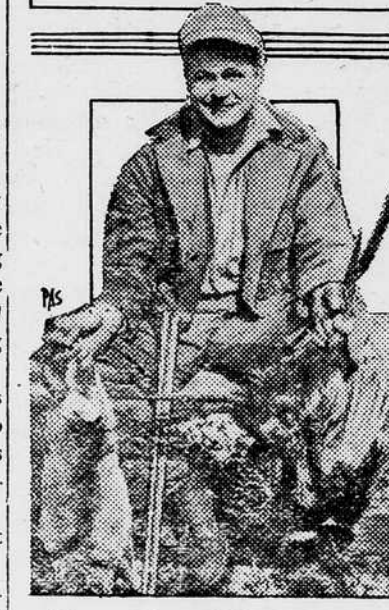
Jimmy Foxx, Philadelphia first baseman, voted the American League's most valuable player for the last two years, was one of the first nimrods in the field at the opening of the hunting season in Pennsylvania. He was after small game and got it.