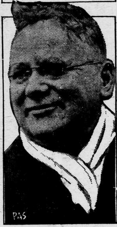
Maxim Litvinov, Soviet Russia's Foreign Affairs Commissar, photographed at Washington, during the days while he conferred with the State Department and President Roosevelt in person, regarding terms of the United States recognition of Russia.

lobby in opposition to the bill, and a big fight is ahead. The opposition is not alone from manufacturers and advertisers, but also from newspapers, which would be seriously affected. The strongest ground of opposition is the danger of putting control of any business into the hands of Government bureaucrats, which the Tugwell bill, in its present form, would do.