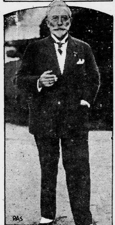
DOORN, Holland. . . . Wilhelm Hohenzollern, former Kaiser of Germany, in exile here since the World War, celebrated his 75th birthday on January 27th and released this recent picture to show himself still " hale and hearty "