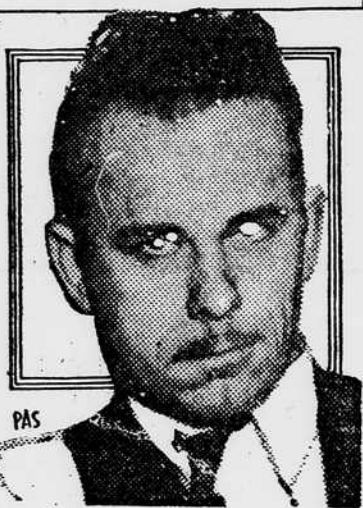
TUSCON, Ariz. — John Dillinger, (above), leader of a notorious gang of Indiana outlaws, who was captured here with three of his gang. He is being returned to Indiana.