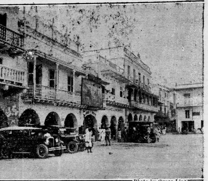
ON OUR PRESIDENT'S ROUTE

THIS is one of the old balcony-hung streets in Cartagena, Colombia, one of the few ports which President Roosevelt elected to visit, on his summer cruise. Despite the fact that the city lies on the path of the popular cruise route between New York, California and the Central Americas and is visited by hundreds of travelers every year, it has taken on but few of our modern ways.