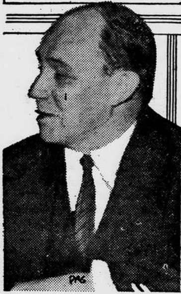
WASHINGTON... Donald Richberg (above), Director of the Industrial Recovery Board, is the man around whom the administration of the NRA now swings as General Hugh Johnson definitely stepped out, on October 15.

would now be in the very depths of despair, the farm agent declared.