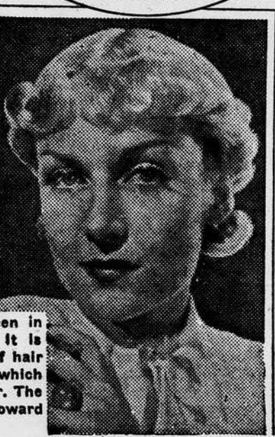
A REVIVAL IN HAIRDRESS is seen in Carole Lombard's newest coliffure. It is reminiscent of the day when rolls of hair were trained over little gadgets which spent the night in the bureau drawer. The front curls roll accommodatingly up toward the top of the head.