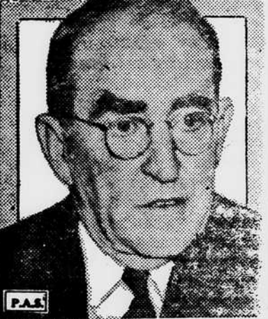
WASHINGTON . . . A newly posed picture of Representative Wm. B. Bankhead of Alabama elected Speaker of the House of Representatives at the death of the late speaker Joseph W. Byrns of Tennessee.