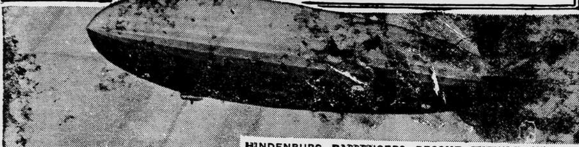
HINDENBURG PASSENGERS BECOME "NEWS." With reporters, cameramen and newsreel apparatus to the right, left and in front of them, those who boarded the Hindenburg were faced with the problem of answering scores of questions, facing as many cameramen and taking into the sound apparatus of the newsreel men, all at once. Dr. Williams M. Scholl, millionaire foot specialist and manufacturer of foot comfort appliances, who made the trip, is shown facing the battery calmly. Dr. Scholl had a little more experience than most of the other passengers, having sailed on the Graf Zeppelin six years before. He is making an 18,000 mile business trip to eleven European cities in 18,000 minutes. Above is a view of the Hindenburg.