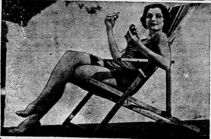
WITH THE OPENING OF THE BATHING SEASON the beaches are thronged with those fortunate enough to escape the heat of congested cities. The latest styles in bathing suits are being displayed which add a touch of color to the beach parade. To be at their best the ladies must necessarily carry with them their containers, closures and lipsticks. The art of make-up is as essential on the beach as in the ball room. Atmospheric conditions at summer resorts have a very corrosive effect on metals that will rust. That is why most all the ladies insist on their containers, closures and lipsticks being made on a base of brass, a copper alloy, because brass cannot rust.