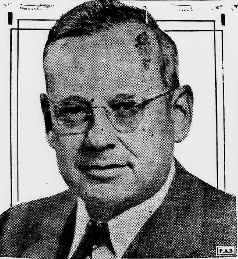
TOPEKA, Kas. . . The most recent and a specially posed photograph of Governor Alfred Mossman Landon of Kansas, which was taken the week preceding the Republican National Convention at Cleveland.