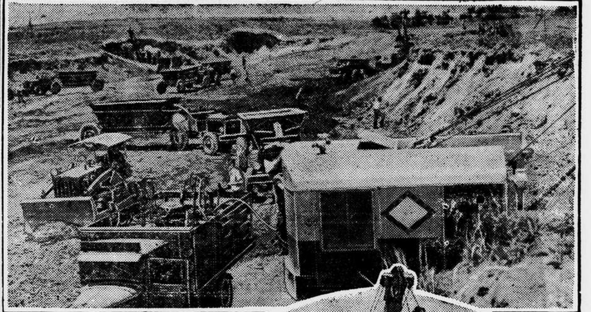
Top: Some of the 150 automotive machines creating a World's Fair out of an ash heap.

Excavation Task a Terrific Test of Men and Machines