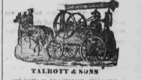
TALBOT & SONS. SHOCKOE MACHINE WORKS, RICHMOND VA.

Full and Complete. Old Cabinet Whisky a Specialty. FRESH-LAID BEER OR DRAUGHT. He guarantees satisfaction. Call and see him. Nov 21 1y.