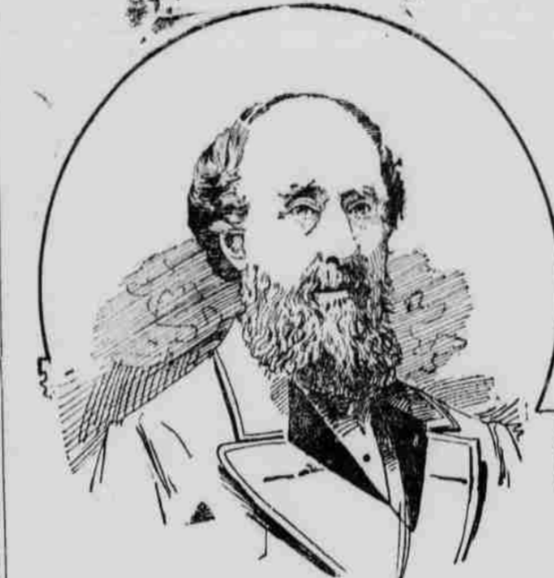
GEORGE WILLIAMS. Founder of the Young Men's Christian Association. The first society of this organization was called into life June 6, 1844, at London.