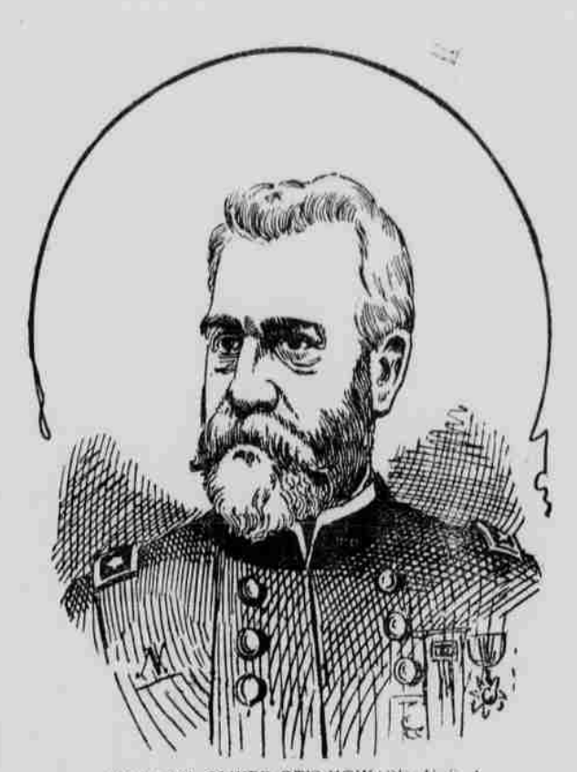
MAJ.-GEN. OLIVER OTIS HOWARD, U. S. A.

AND IT WAS SUCH AN UNWELLY MEAN THING TO DO TOO.