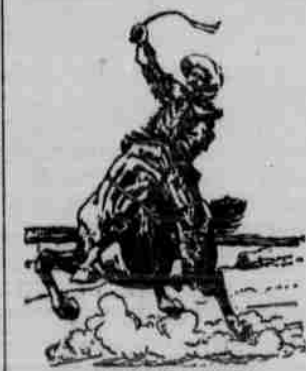
A MADE FOR LIFE.

I've seen a man wear a frown a week and carry a grudge in his heart all his life, but I've seen a boy's tears dried and his wounds healed instantaneously by a mother's kiss. I've seen grown people pound and fret because of supposed slight, but I've seen a sadly neglected boy quiet and uncomplaining. I've seen men brawl and fight over slight differences of opinion, but I've seen an unmercifully beaten boy kiss the hand of his heartless parent as soon as the smacking ceased. I've seen men plunge into questionable enterprises without stopping to think, but I've seen a boy hold back from inviting amusements and asks: "Father, do you think it is wrong?" God bless the boys! the pure, true boys. They make us sigh for the innocence we have outlived and which might yet have been ours.