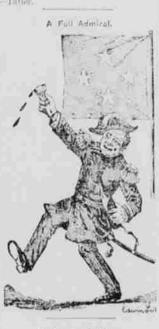
He Wanted to Know.