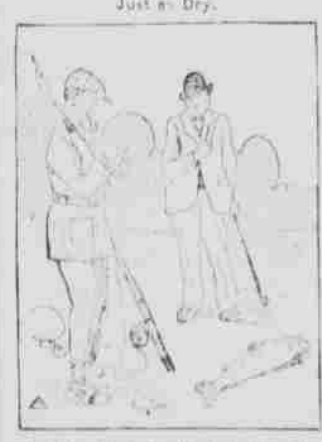
let an other on the other was used in a half dream."