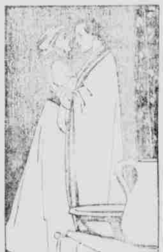
A LITTLE GIRL WRITING A LETTER. She had a "pocket" and she was very proud of it.