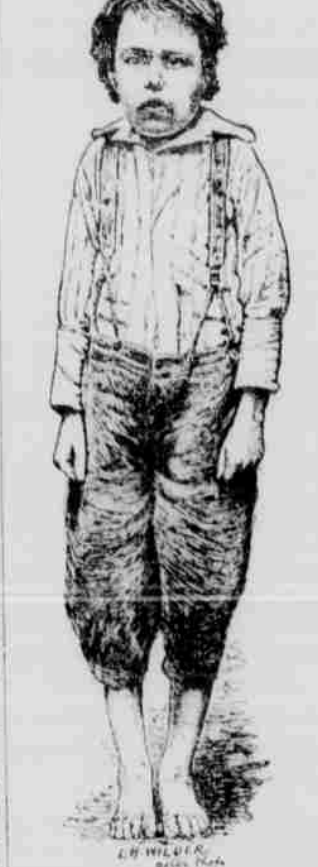
Boy, 18 years of age, suffering from severe case of Hookworm infection. Growth greatly retarded, suffered from palpitation of heart and stomach trouble; gets out of

TREATMENT. This will absolutely cure every case. Is simply and in no way injurious or dangerous