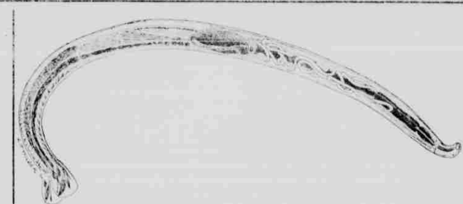
A male hookworm (known as the American murderer-because a kills so many people), very such magnified under an instrument known as a microscope. See how as head is turned backcard, and how its tail is broadened into an umbrella like organ