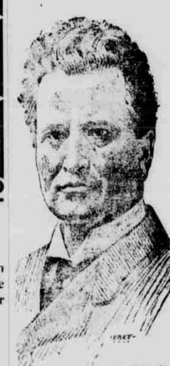
SENATOR ROBT. M. LAFOLLETTE. Senator LaFollette, at a picnic in Madison, was praising a young Milwaukee couple that had just got married.