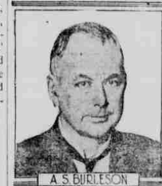
A. S. BURLISON

"A Hundred Pound Package Has No Terrors for Me," Declares Postmaster General Burleson.