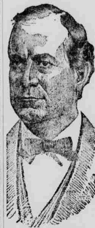
HON. WILLIAM J. BRYAN.

Satisfied If He Has Given Anyone Strength to Help Him to Resist Temptation.