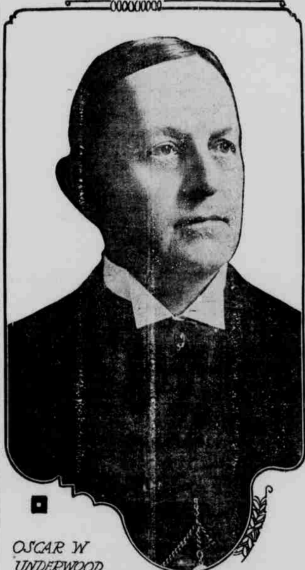
OSCAR W. UNDERWOOD

He is The Choice of the People of Alabama for the Long Term in the United States Senate.