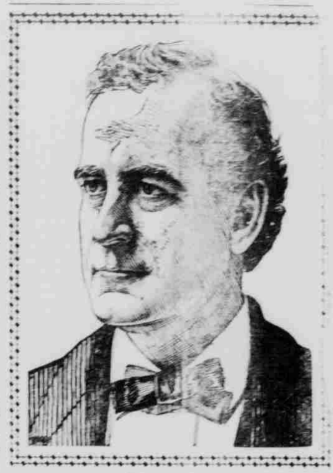
WILLIAM J. BRYAN