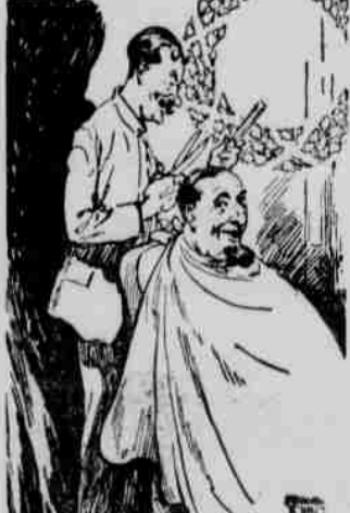
"I Decided on a Haircut for My Christmas Gift to Myself."

have to cost very much to make a hit with me if I give it to myself with the proper spirit. "It's the giving, rather than the receiving, of this gift that brings me the more pleasure, anyway. "Well, gasoline has been going up pretty steadily lately—you notice I do not talk in dialect in spite of my rural name and predilections; if I talked in dialect I would say gas was going up purty stiddy—and, due to the increased cost of living expenses, I decided that it behooved me to economize. "So I decided on a haircut for my Christmas gift to myself, and I decided to get it early on account of the poor, tired shopgirls who are wishing the store would close so they can crowd in a few more dances with the dashing young ribbon clerks three aisles over. "Whereupon I got a haircut, a good, short one. "The rest of the story is soon told. I got it cut again last night, and I had to wait for six customers ahead of me who were telling the barbers to shave 'em extra close so it would last over to Monday. "That much for early Christmas shopping. I bought the junk for the folks after they'd locked the street doors last night and have just been making the rounds of the drug stores to pick up the odds and ends I've forgotten. No more Christmas shopping in suits, Gladys, Dobbin." And with a peremptory cluck to his steed, Timothy Hay motored away in high dudgeon—Denver Times.