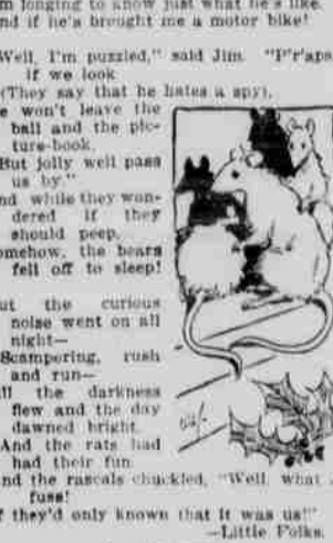
A VERY MERRY CHRISTMAS

At a quarter to twelve on Christmas eve Teddiums woke with a start. "There was somebody tagging him by the sleeve. And he turned with a thumping heart. "Now, don't make a sound!" a soft brother Jim. "As sure as ever I'm here—it's him!" "It's true!" whispered Teddiums. "Santa Claus! Oh, isn't this simply great!" "Can't you light up a match, Jimmy—just to see if he's too late?" "I'm longing to know just what he's like. And if he's brought me a motor bike!" "Well, I'm puzzled," said Jim. "If I see him, he'll leave the ball and the picture-book. But jolly well pass us by." And while they wondered if they should peek, Somehow, the bears fell off to sleep! But the curious noise went on all night—Scamparing, rish and run—Till the darkness flew and the day dawned bright. And the rats had had their fun. And the raccoons chuckled, "Well, what a fuss!" If they'd only known that it was us!" —Little Folks.