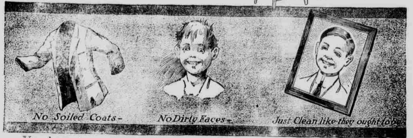
No Soiled Coats—