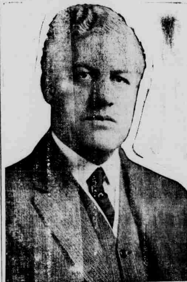
HON. A. MITCHELL PALMER.