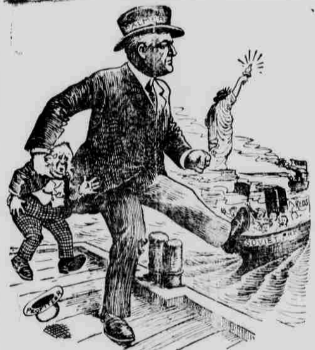
The Fighting Quaker

A woman should grow more beautiful as she grows older and she will with due regard to bath, diet and exercises and by keeping her liver and bowels in good working order. If you are laced and yellow, your eyes losing their lustre and whites becoming yellowish, your flesh flabby, it may be due to indig- estion or to a sluggish liver. Cham- berlain's Tablets correct these disorders.