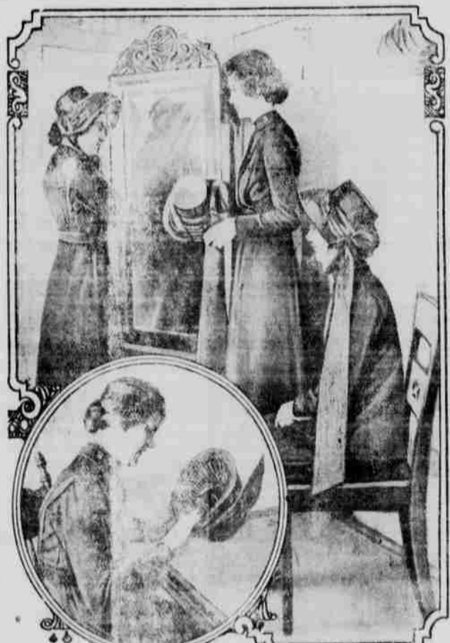
TRIMMING A BONNET