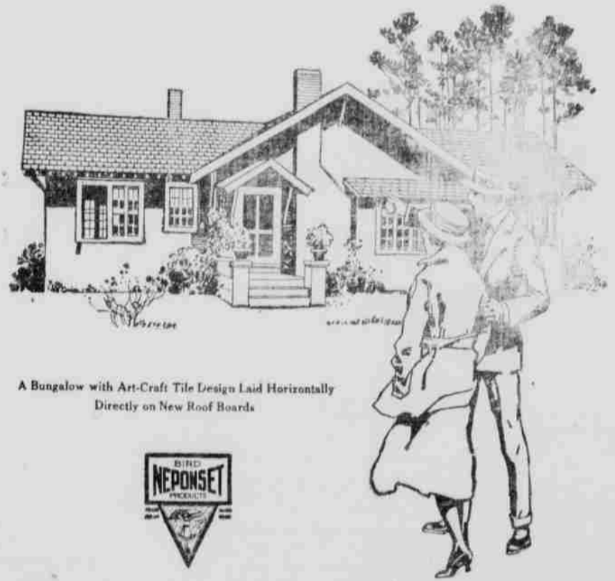
A Bungalow with Art-Craft Tile Design Laid Horizontally Directly on New Roof Boards