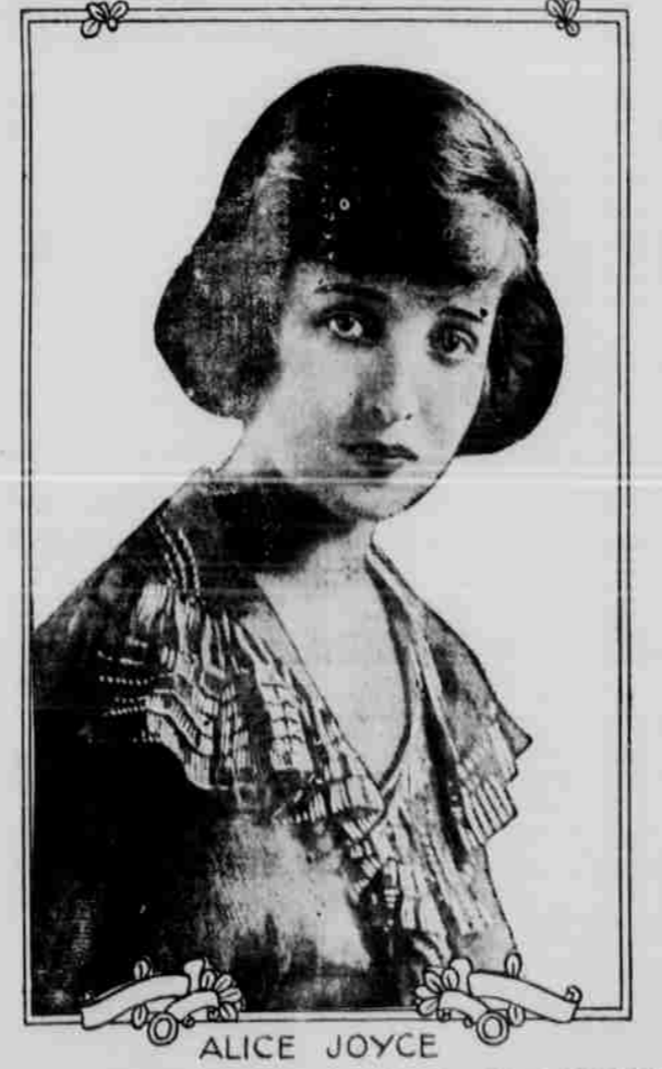
ALICE JOYCE Of all the reigning favorites of the early motion pictures, Alice Joyce alone shines as a star today. With such notable plays as Charles Klein's "The Lion and the Mouse" and "The Third Degree," the famous Drury Lane melodrama, "The Sporting Duchess," Rex Beach's story, "The Venetian of Durand," and "Staves of Pride" as her medium, Miss Joyce has entered an era of steadily increasing popularity. She occupies a place among the rulers of the screen.