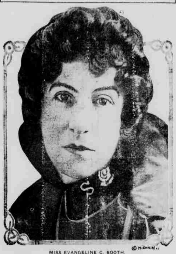
MISS EVANGELINE C. BOOTH, Commander of the Salvation Army in the United States. WITH the $14,000,000 fund generously contributed by the country to the Salvation Army last May all but exhausted through the Army's unparalleled year of activities and service throughout the country, Commander Miss Booth is now marshaling her forces for the organization's second nationwide Home Service Appeal to be held May 10 to 24. "It makes me extremely happy to report, even before the full statistics of the year's work are in hand," the Commander stated in New York recently, "that never before in the history of the organization in this country has the Salvation Army been able to accomplish so much for the poor, the distressed, the sick, the unfortunate and the erring." "All this is because of the magnificent way America has supported our efforts. We are deeply thankful to God and country for the opportunities of Christian and humanitarian service that have been afforded us during the last few months. Very shortly, now, we shall give an accounting of our trusteeship, and soon thereafter we plan to go to the country again for the encouragement and funds with which to maintain our many vital activities throughout another twelvemonth."