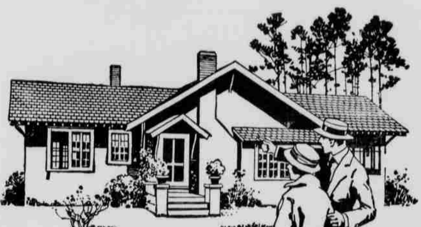
A Bungalow with Art-Craft Tile Design Laid Horizontally Directly on New Roof Boards