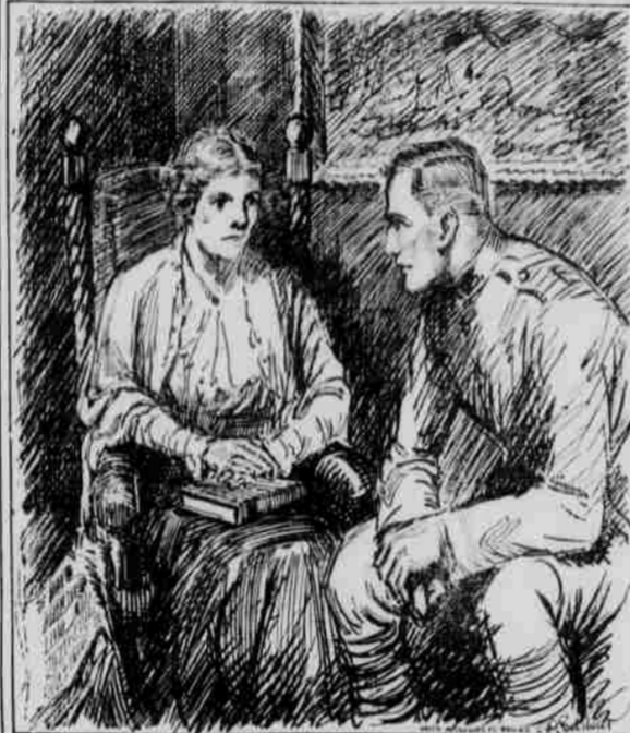
Ain't it a Grand and Glorious Feeling to Have Your Son Return With Wounds Stripes and Tell You of Seeing German Women Vote.

WITH THE FEDERAL SUFFRAGE AMENDMENT NOT YET RATIFIED.