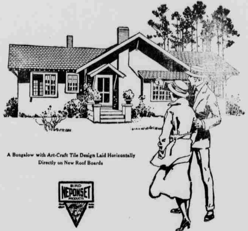
A Bungalow with Art-Craft Tile Design Laid Horizontally Directly on New Roof Boards