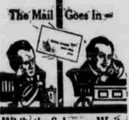
While the Salesman Waits

We can furnish you the kind of printed sales letters and circulars on HAMMERMILL BOND that will get your message in the right way to the man who can buy your goods. Use more printed salesmanship. Ask us.