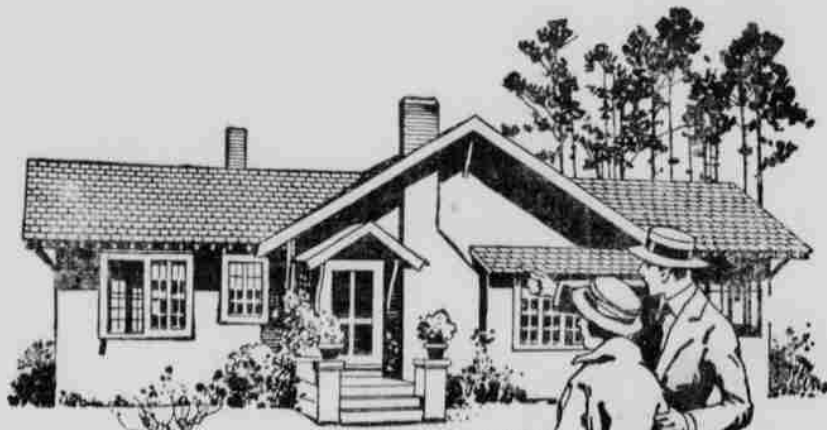
A Bungalow with Art-Craft Tile Design Laid Horizontally Directly on New Roof Boards