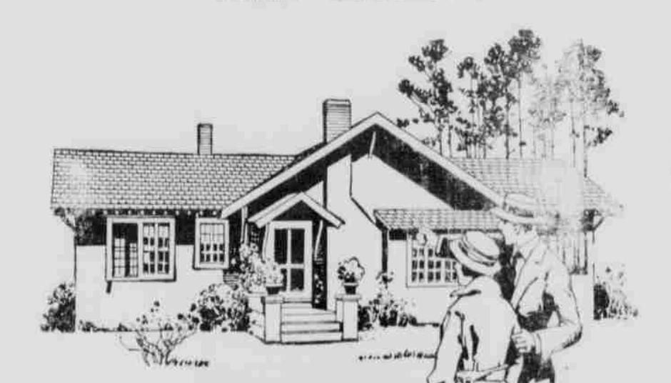
A Bungalow with Art-Craft Tile Design Laid Horizontally Directly on New Roof Boards