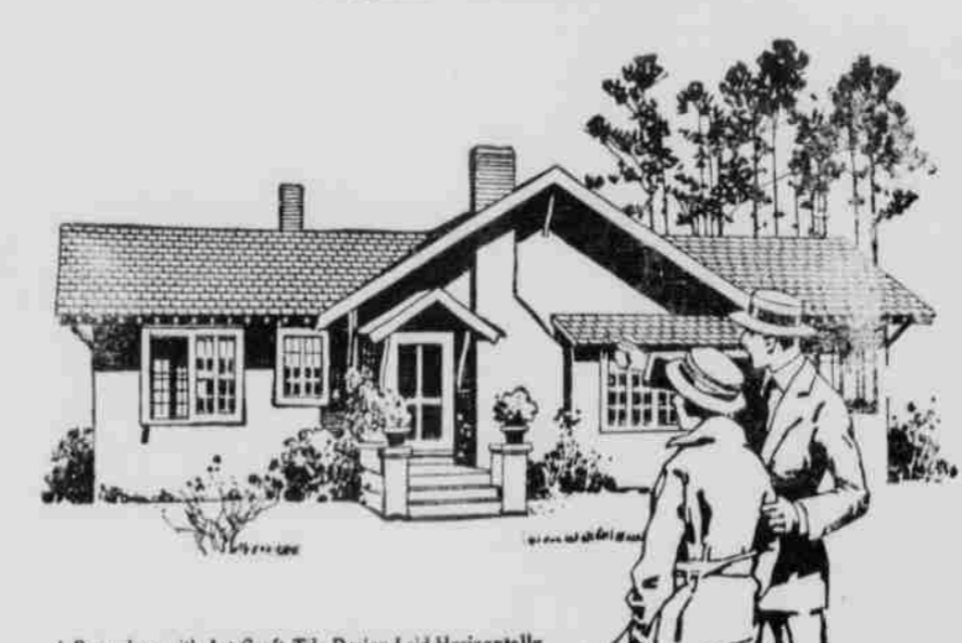
A Bungalow with Art-Craft Tile Design Laid Horizontally Directly on New Roof Boards