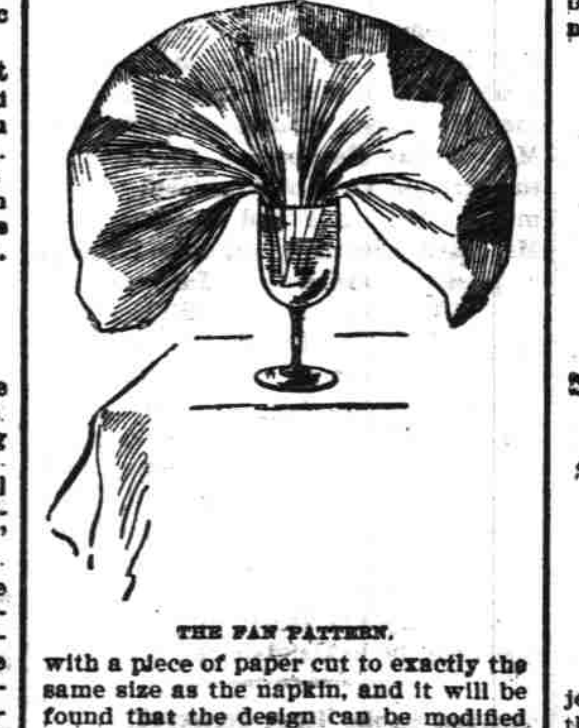
Table napkin felding is an art and one of those things in which both skill and taste can be shown. The fan pattern is one of the most simple and effective, and any girl who is fairly deft with her fingers can easily copy it after a close inspection of the illustration herewith. The best way is to practice