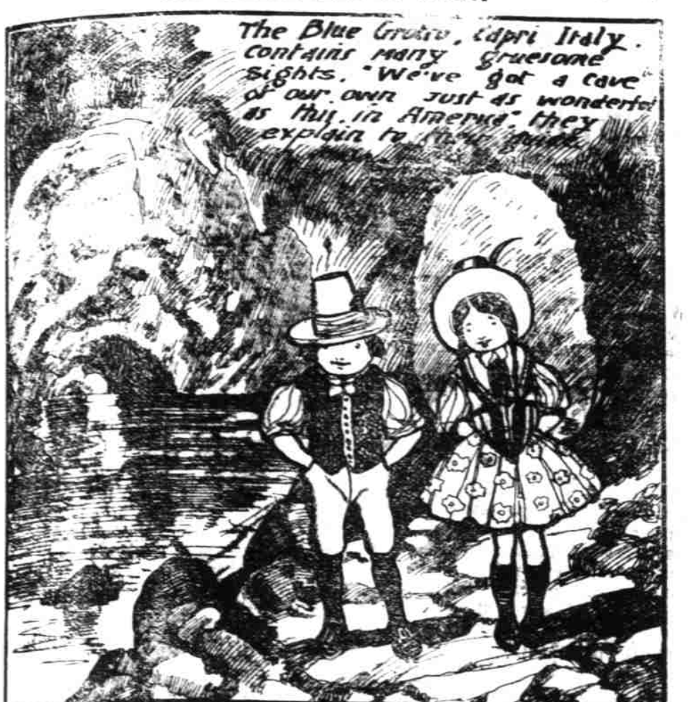
FIND THE TWO BANDITS.