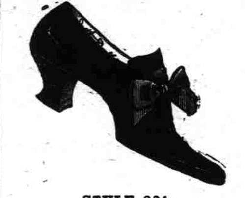
STYLE 221. IDEAL PATENT VIOLET. Price $3.00. Sold only at SOLOMON'S SHOE STORE.