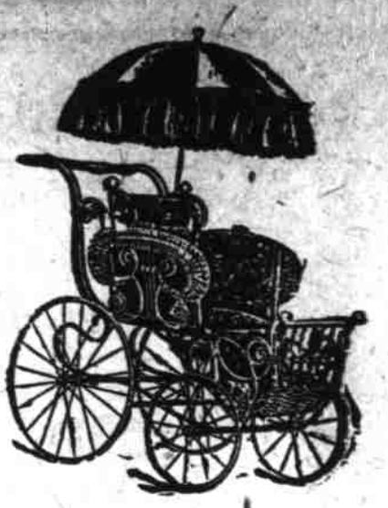
Large Assortment in All the Different Woods.