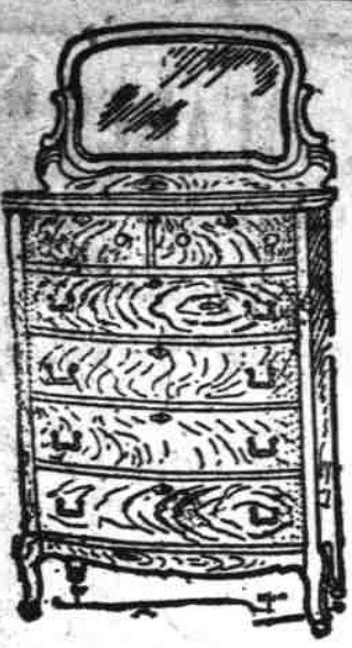
100 Styles of 1907 Designs. The Very Latest.

He is not only idle who does nothing, but he is idle who might be better employed.—Socrates.